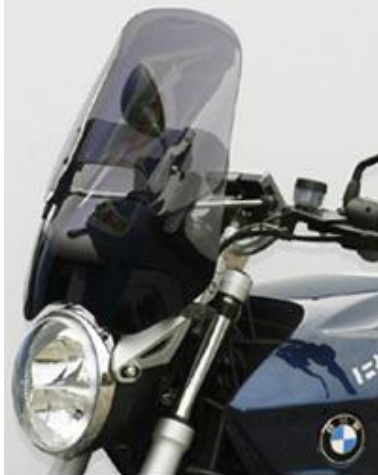
Vario Screen pictured on BMW R1200R