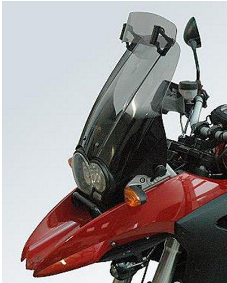
MRA VarioTouringScreen The VarioTouringScreen features a 7-position adjustable spoiler at the top of the wind deflector that can adjust the airflow to suit the rider.

MRA also manufacture screens for unfaired bikes.