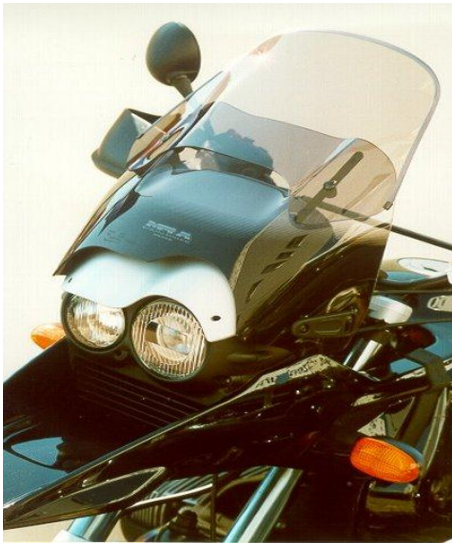
MRA VarioScreen The two-piece Varioscreen can be adjusted by angle or height and features an internal wind channel to reduce turbulence.