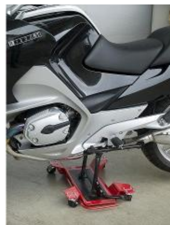
Motoboy II ACA23101 For motorcycles with sidestands.