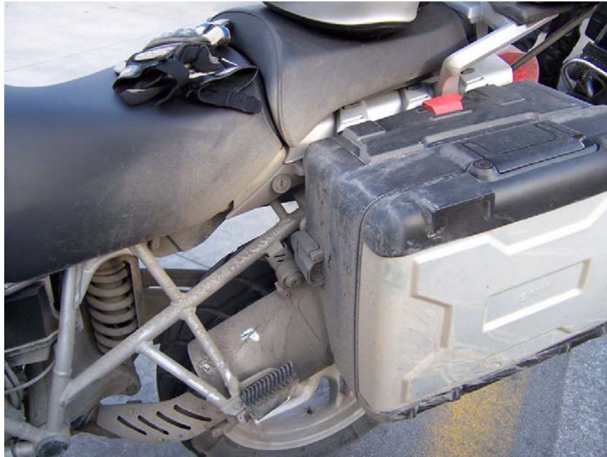
Bike with crud guard fitted