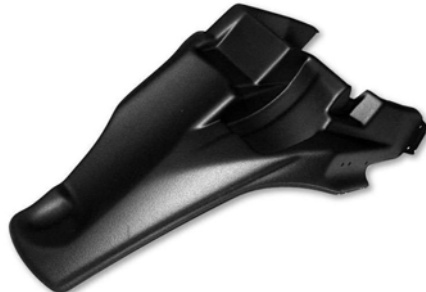
R1200GS/Adv 08 on Non ESA