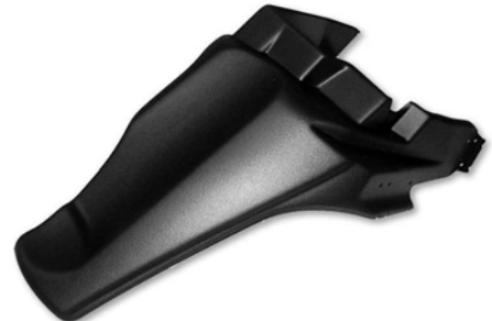
R1200GS/Adv 08 on with ESA

This brilliant Raid Crud Guard is designed to attach under the rear seat, keeping the rear of the motor and shock absorber clear of road grime, dirt, dust, and excessive water, even reducing mud build up if riding off-road. Developed and designed in Italy over thousands of kilometres in all weathers and terrain